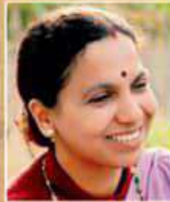
Madam Jayanti Ravi (IAS) Commissioner of Health, Gujarat State